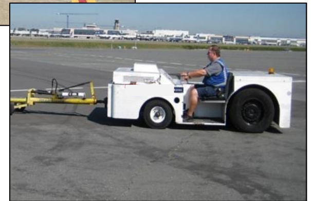
Figure 4: Regional Pushback