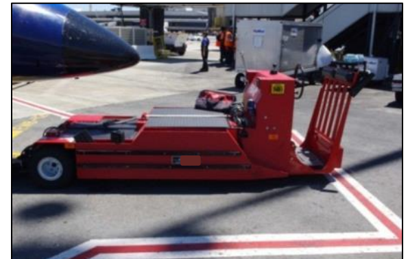
Figure 8: Regional Standup Cab