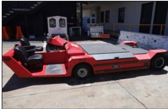
Figure 5: Regional Open Cab