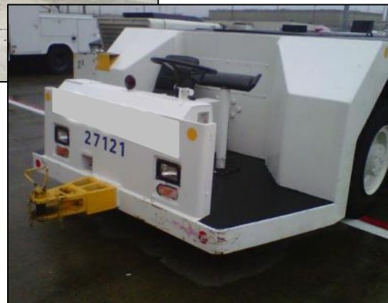
Figure 2: Standup Cab