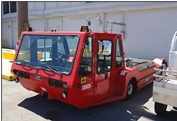
Figure 6: Regional Closed Cab