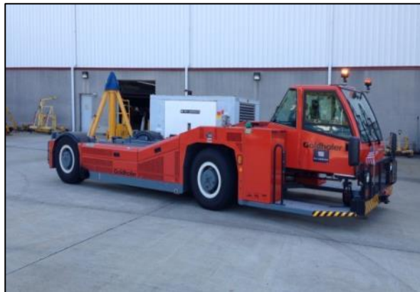
Figure 7: Mainline Closed Cab