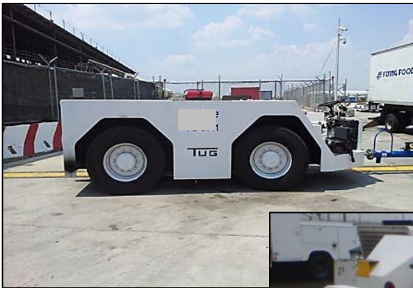
Figure 1: Mainline Open Cab