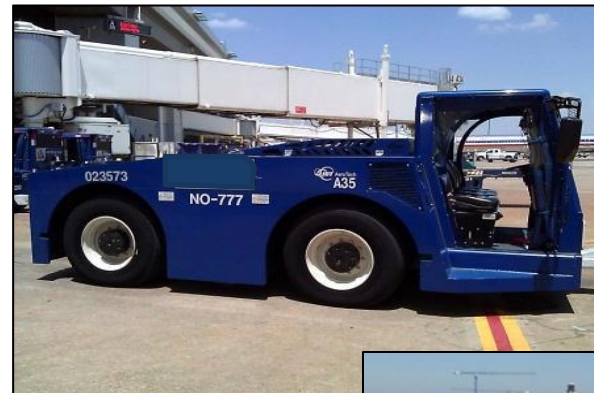
Figure 3: Mainline Closed Cab